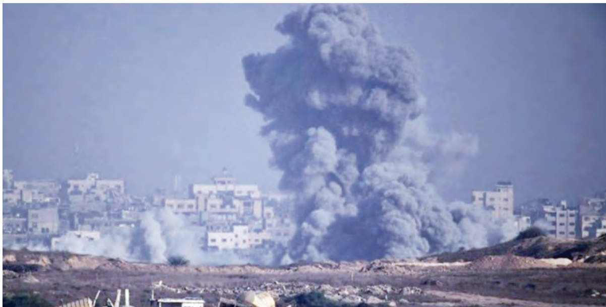
Smoke rises to the sky following an Israeli airstrike in the northern Gaza Strip as seen from southern Israel on Monday

It was the latest in multiple Israeli attacks on hospitals throughout the war. Hospitals have been overwhelmed by war-wounded and now by increasing numbers of malnourished, as