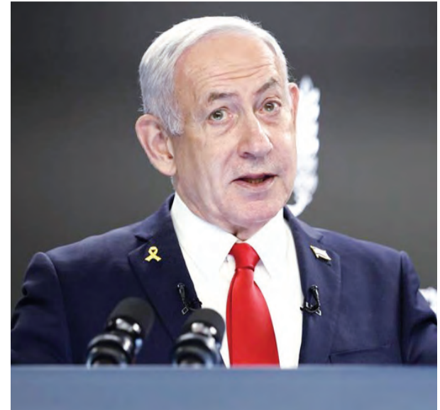
Israeli Prime Minister Benjamin Netanyahu