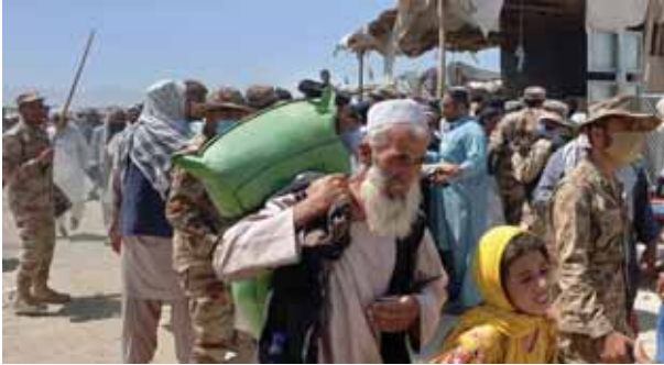
Pakistani soldiers stand guard while stranded people walk towards the Afghan side at a border crossing point, in Chaman, Pakistan on Friday

Pakistani border and security personnel clashed with hundreds of Afghans wanting to cross into Afghanistan from a key border crossing in Chaman closed by Taliban in the restive Balochistan province.